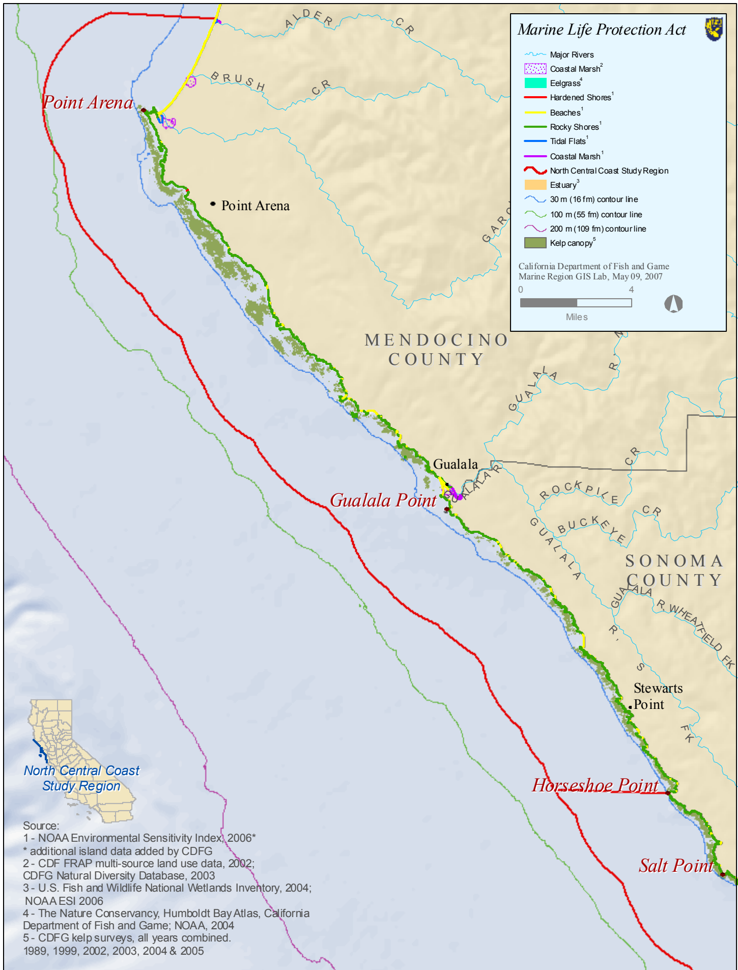
Map 2 a Intertidal and Nearshore Habitats