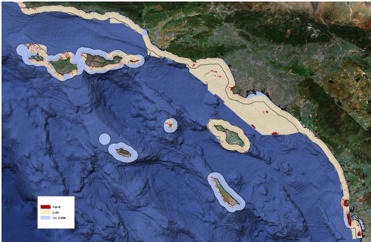
Figure 2. Map of seafloor habitats from side-scan sonar mapping efforts. Mapped habitats are hard bottom (red) and soft bottom (tan). Areas in light blue (state waters) and dark blue (federal waters) were not mapped using the side-scan sonar.

The five bioregions identified for the SCSR contain different amounts of marine habitats identified by the SAT as important for MPA planning (Table 1). These habitats include consideration of bottom type, depth, and biogenic habitat. The seven-eight military use areas also are of different sizes and occur throughout the region, therefore their impact on the MLPA planning process will differ by bioregion.